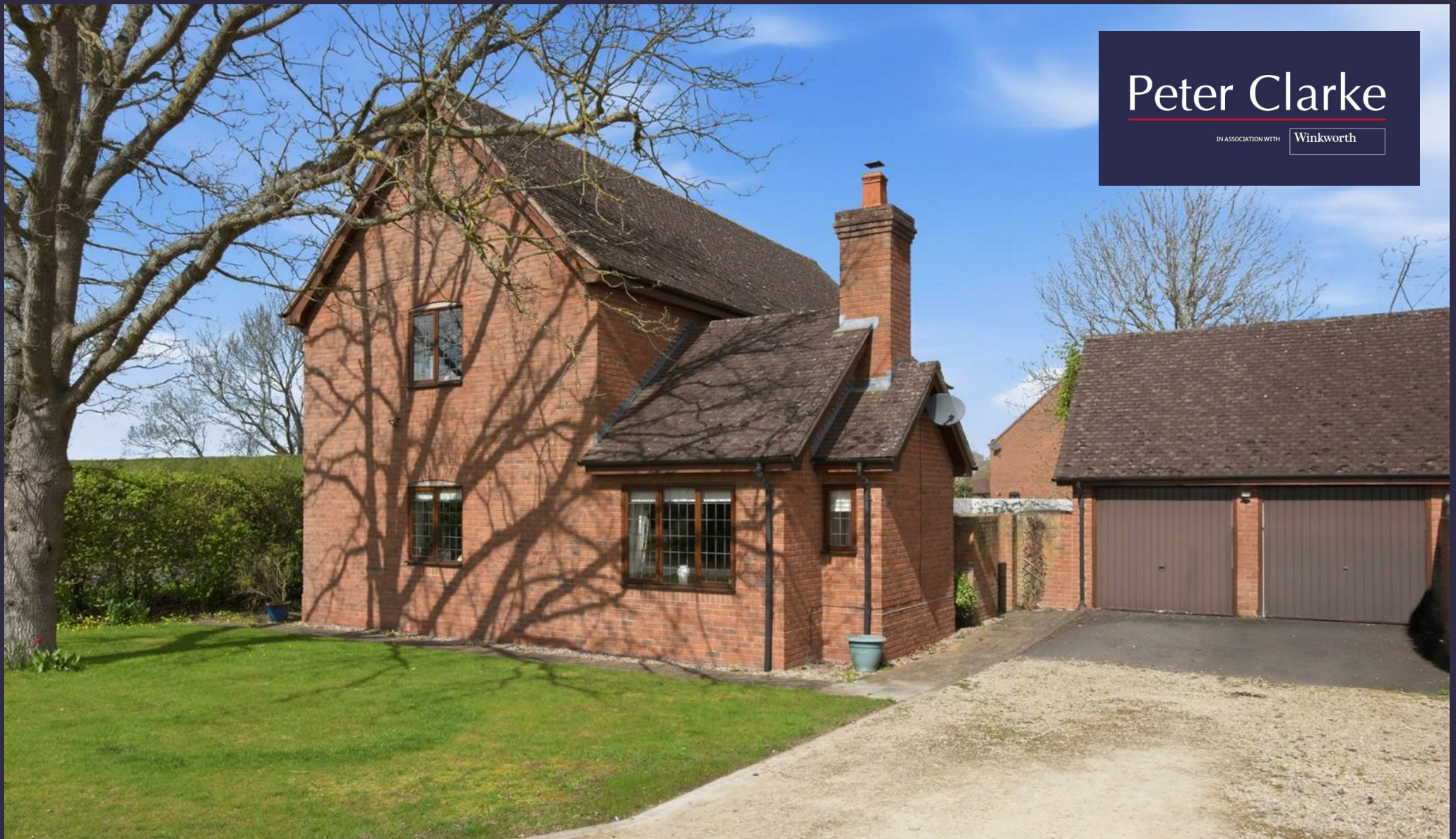
Acorn House, 1 Hopkins Field, Long Marston, Stratford-upon-Avon, CV37 8QY